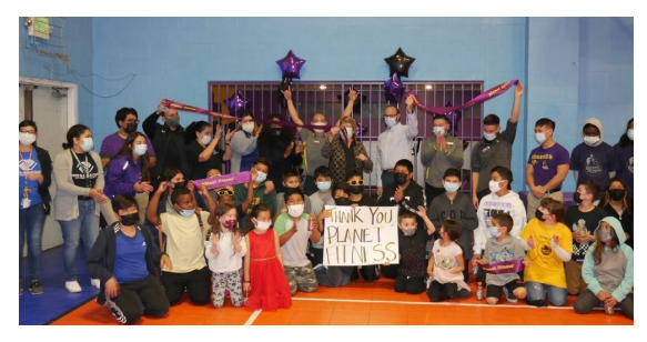
East Fresno Club & Planet Fitness representatives celebrate with a ribbon cutting ceremony