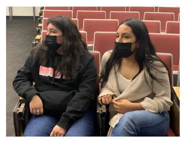
Orange Cove members experience a university classroom and receive academic information.