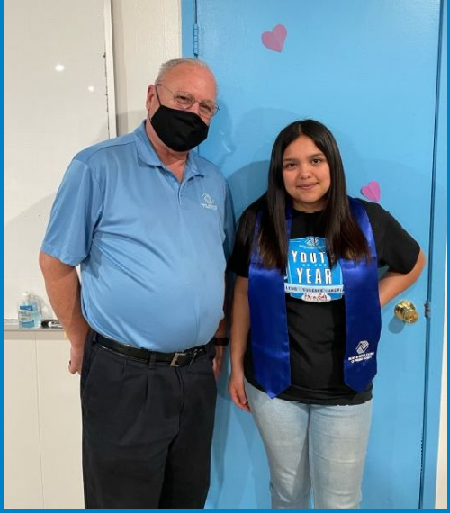
Read the full story <u>here.</u> Watch the show <u>here.</u>